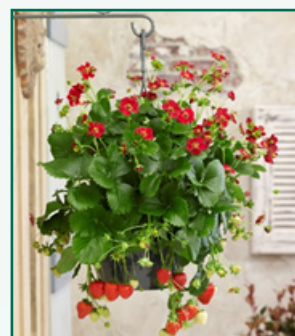
'Ruby Ann' in a hanging basket basket