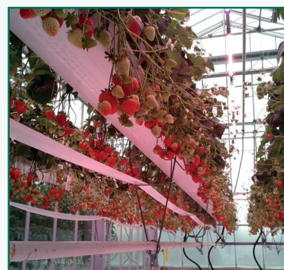
Delizzimo with LED grow lighting