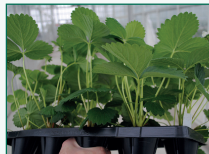
Tray Plant 9 cm cup